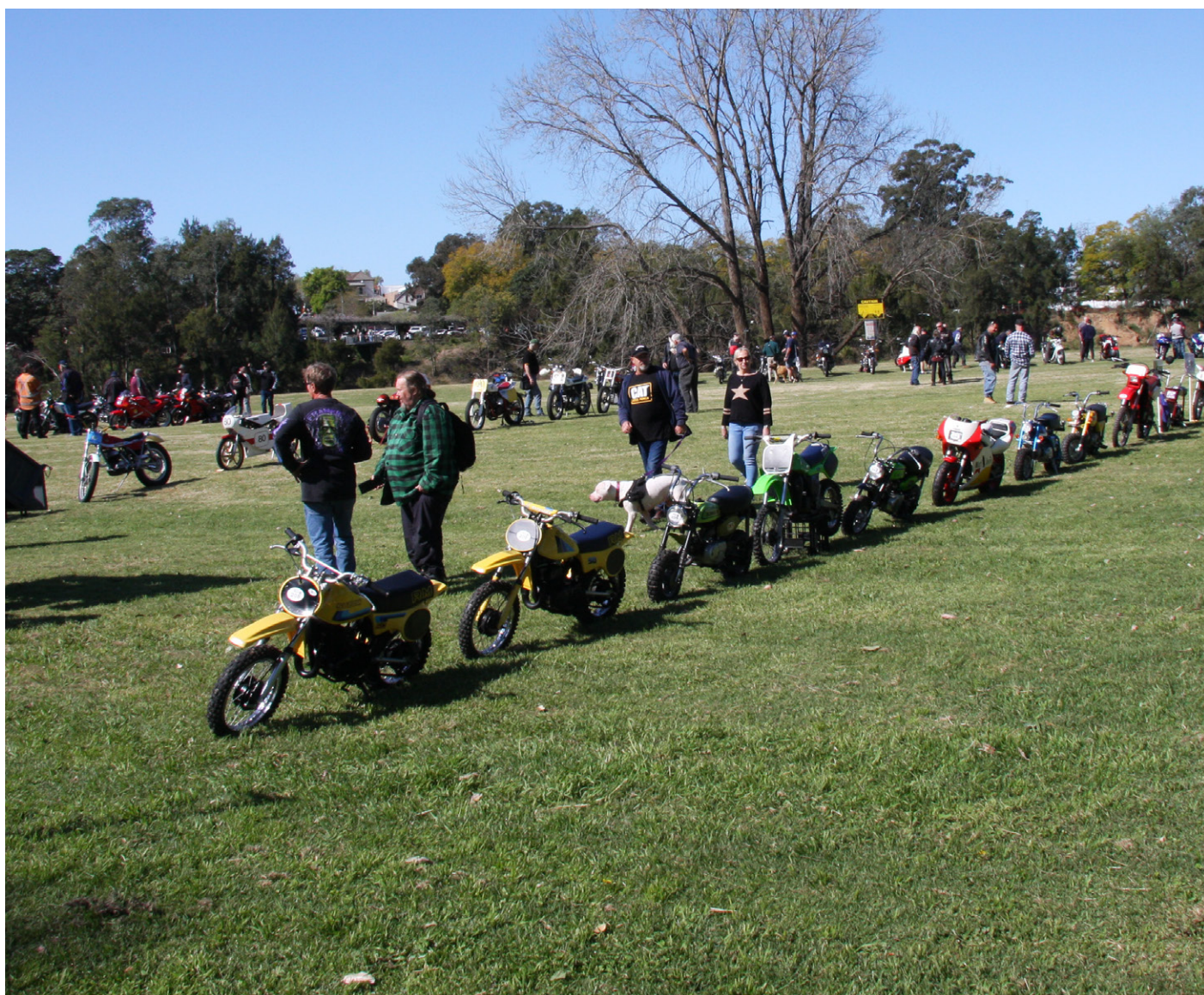
Some of the Mini Bikes from Show Day 2023

THIS WILL FEATURE THE POSTPONED MINI-BIKE DISPLAY!